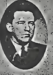
Floyd Gouner Auto Supplies